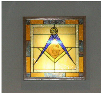
Our new stained glass insignia in the East.

Tickets available from Lodge Officers. Reservations are necessary for menu planning.