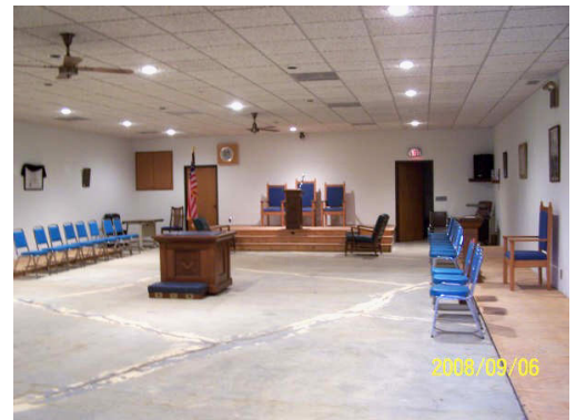
Before the renovation

Now complete this Fall, the Lodge Room has new carpeting, freshly painted walls, new ceiling tiles where needed, and plush new pew seating on the sidelines. The floor officers also have new comfortable seating. The crown jewel is our new stained glass insignia in the East thanks to Bro. Ron Aldridge and James Sparks.