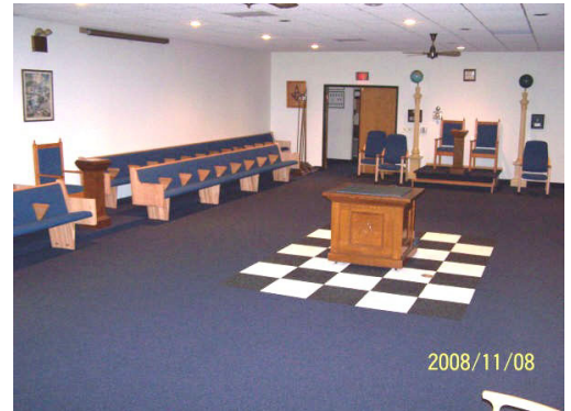
New look toward the East