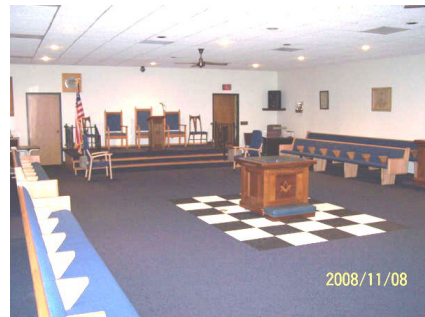
The new lodge look.