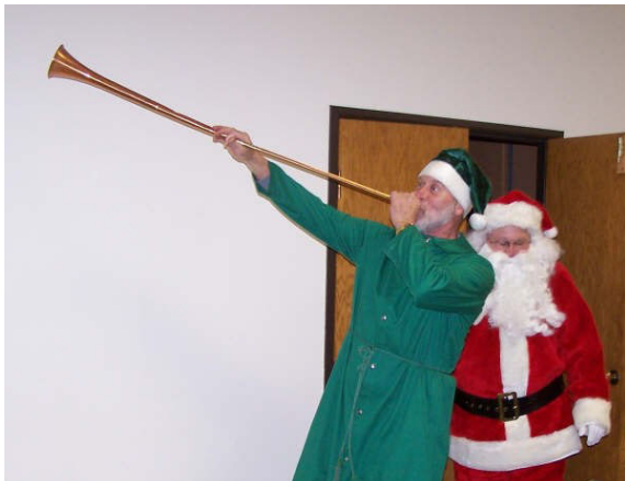
The Chief Elf trumpets in Santa's arrival.