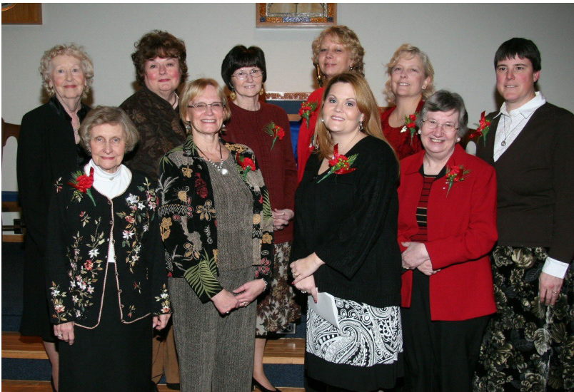
THE LADIES OF NAC 551