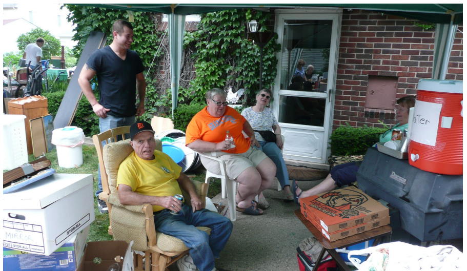
Masonic Yard Sale at its best